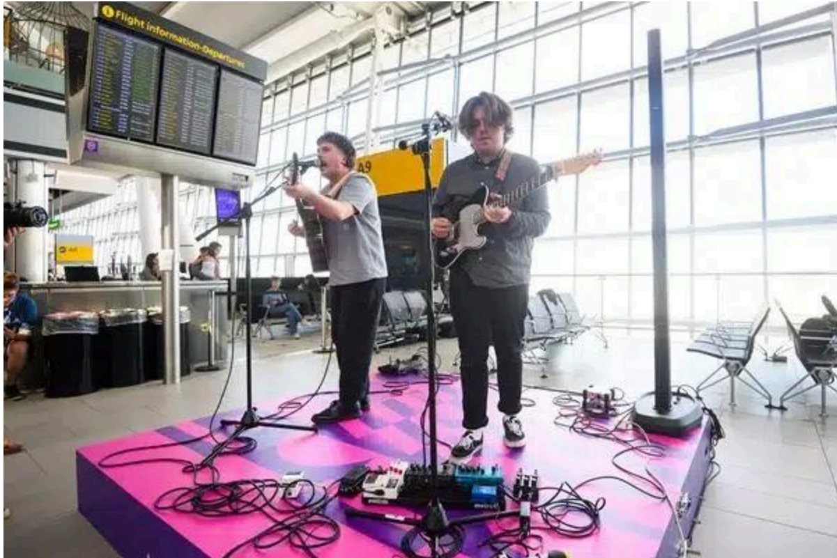
(China Bears Performance,)

Festival season is high at the moment and it's a godsend for anyone who is striving to get a foothold in the industry, especially with the execs passing through Heathrow, I think the Heathrow passengers are going to have a ball at the gigs.